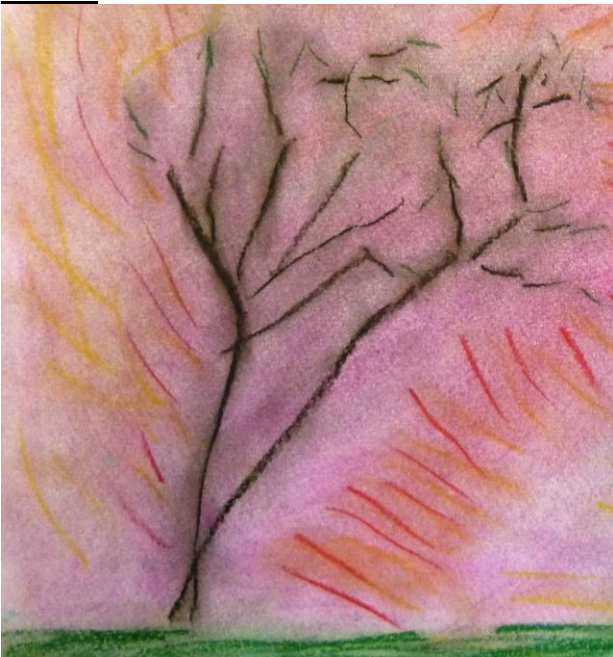
'Burning Bush', by Samuel, age 6