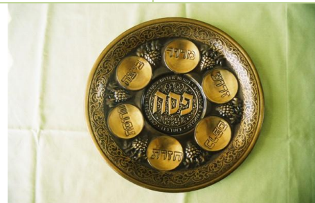
A Seder plate

Use some artefacts and tasting foods for this lesson if you can. The Seder meal uses seven special foods to symbolise the story of freedom. Tasting always makes a lesson more memorable!